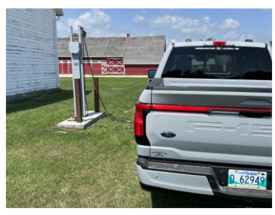
This 2023 Ford F150 Lightning is charging its batteries at the FLO charger at The Commons in Neubergthal.