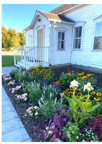
Flowers outside the Bergthal Schoolhouse